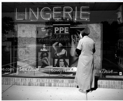
"Curiosity" by Abigail Finch